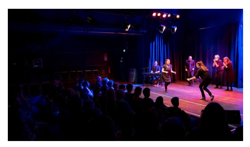
Actors improvise on stage according to the audience's specifications

The actors are inspired by suggestions from the audience. And so every performance is not only unique, but also interactive. Everyone experiences shared moments in a way that is rarely seen. The actors perform without a safety net and the audience becomes part of the creative journey.