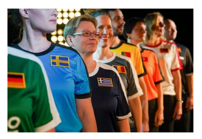
18 countries are represented at ImproEM 2024 in Munich

The tournament will be accompanied by shows for students and a variety of workshops for exchanging ideas with European artists.